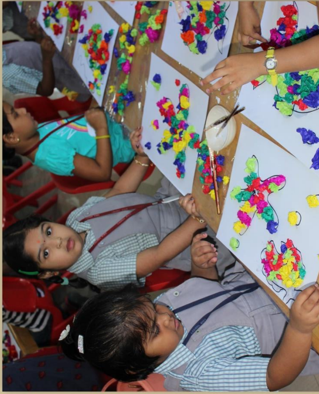
Beautiful creative “Sea Animals” made by LKG students using craft papers and acrylic paints